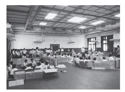
FIGURE 1 Evacuation center experience for junior high school students from outside of Kobe City