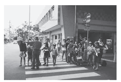
FIGURE 2 Walking tour of disaster areas for a community organization from outside of Kobe City (courtesy of the Futaba Center)

FIGURE 1 Evacuation center experience for junior high school students from outside of Kobe City (courtesy of the Futaba Center)