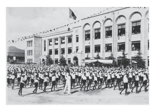
FIGURE 3 Athletics meet in 1938

When the Kobe Earthquake struck on January 17, 1995, the school became an evacuation center for many victims of the disaster.