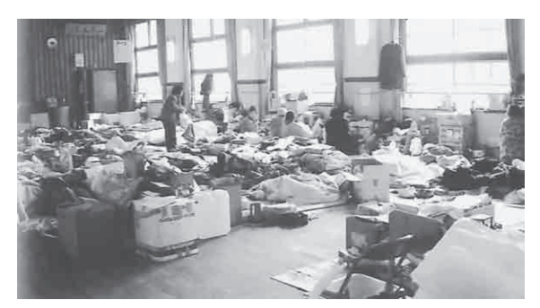
FIGURE 4 School auditorium as an evacuation center for local victims after the quake in 1995

When the Kobe Earthquake struck on January 17, 1995, the school became an evacuation center for many victims of the disaster.